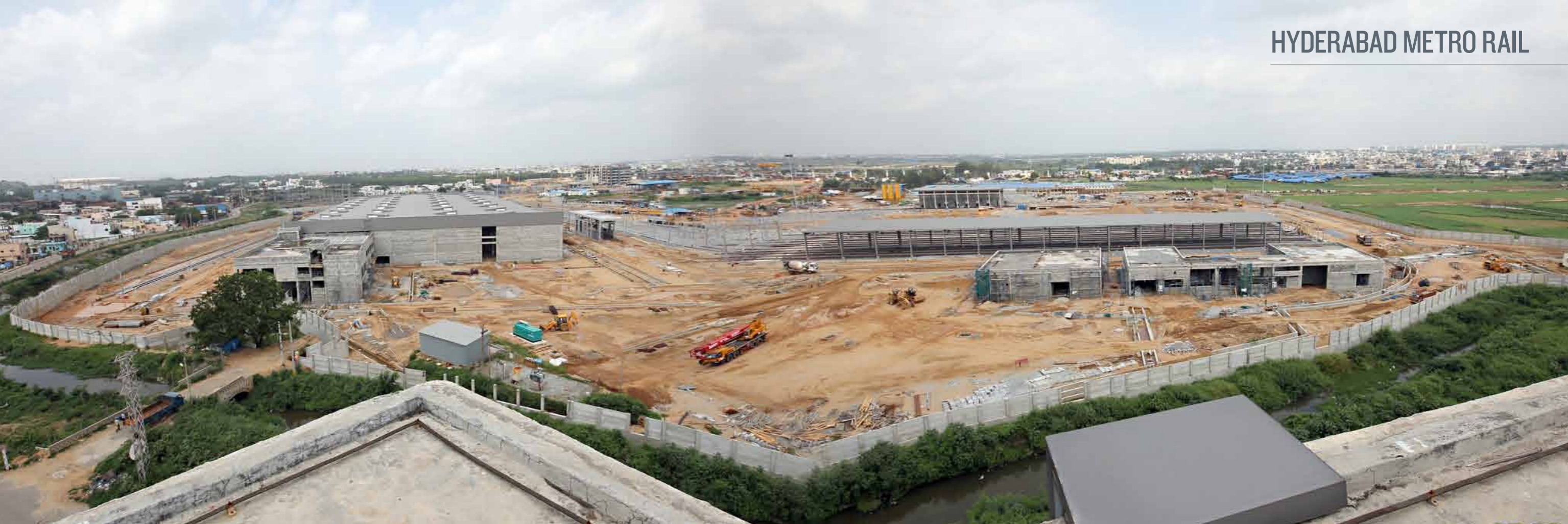
Aerial view of the Hyderabad Metro Rail Mother Depot