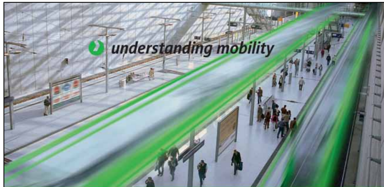
Hyderabad Metro Rail cantilever type station

As a strong player on the world's rail and transport technology markets, Vossloh makes a solid contribution to providing safe, cost-effective and eco-friendly public and freight transport for urban or long-distance lines. In this regard, the Vossloh Group focuses on its core competencies in rail infrastructure, rolling stock and electric buses. Vossloh is synonymous with profound rail expertise and future-proof solutions.