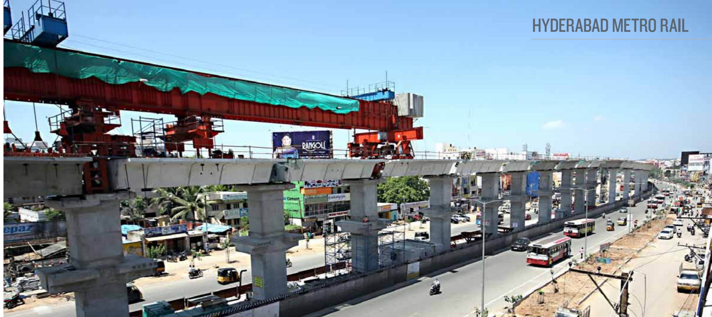
Launching Girder – State of the art construction equipment used to build elevated viaducts of Hyderabad Metro Rail

Because the Metro, he points out, is just part of a much larger vision for the city. “Phase I,